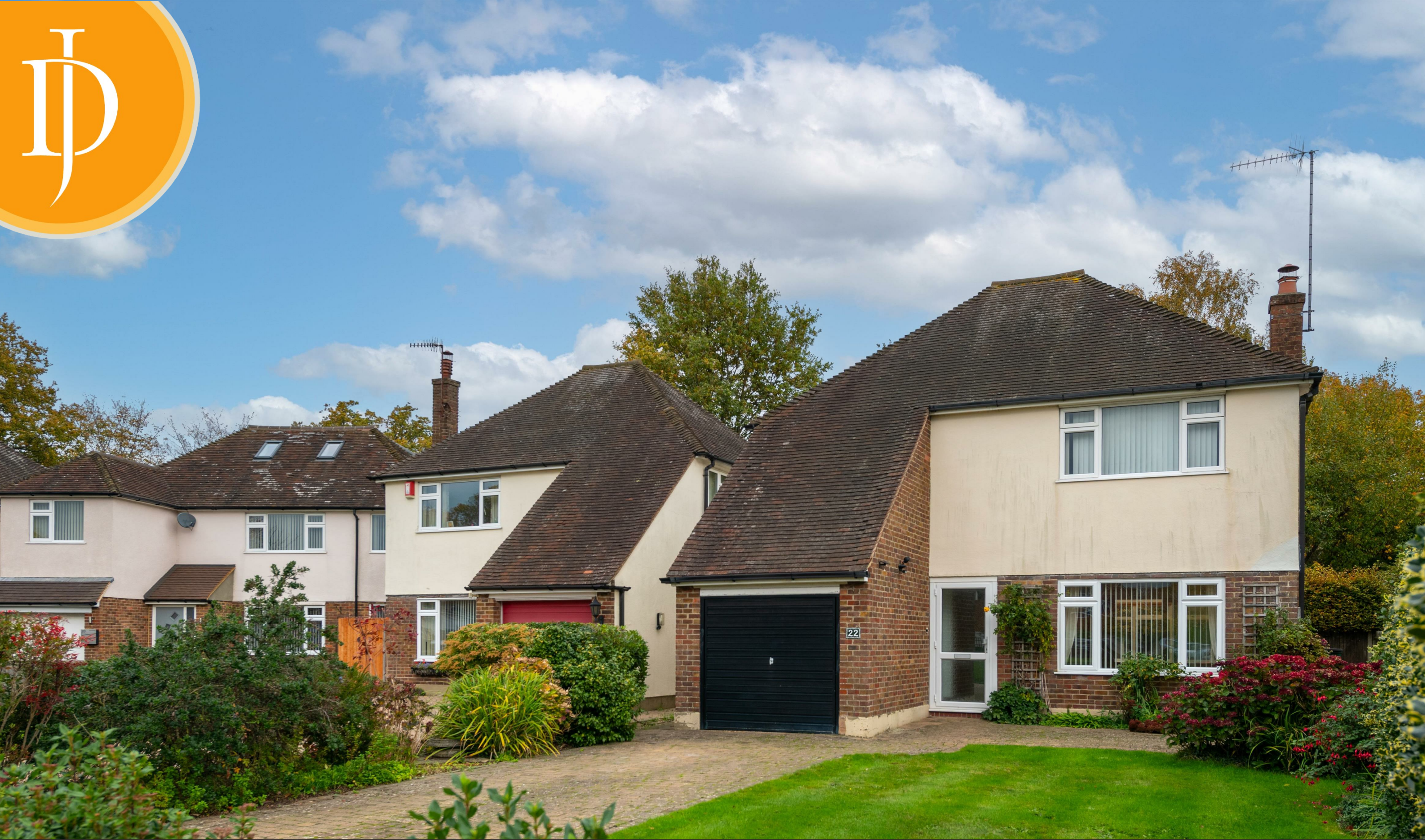
22 Fairlawns, Horley, RH6 9HD Asking Price £525,000